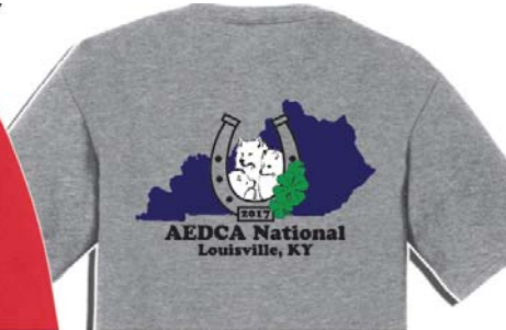
Sample of large logo on back