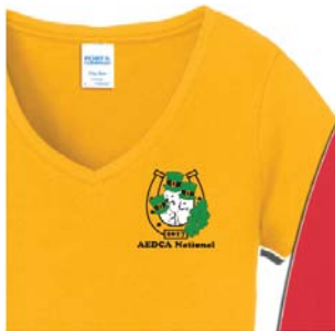
Sample of left chest logo

If ordering multiple variations of same shirt STYLE , please use additional order forms. For example, 2 grey v-neck shirts with different logo placement would require 2 order forms.